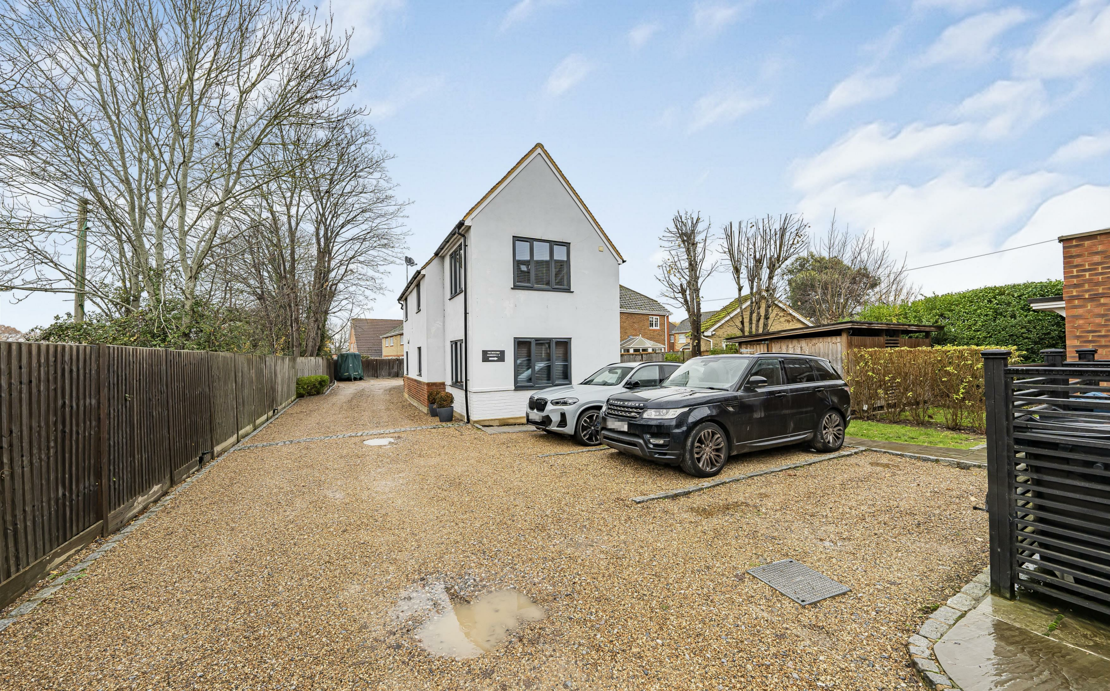
9 The Beeches Oakley Green, Windsor, Berkshire, SL4 4LH £285,000